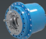
Brevini™ Winch Drive PWD Series