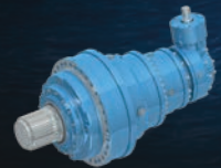
Brevini™ Industrial Planetary Gearboxes – S Series