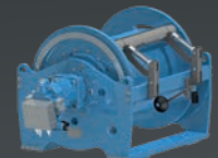
Brevini Evolution™ Series Winches