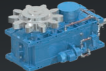
Brevini™ Helical Bevel Helical Gearboxes