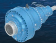
Brevini™ Industrial Planetary Gearboxes – S Series