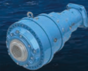
Brevini™ Industrial Planetary Gearboxes – S Series